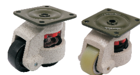
Plate Type Swivel Heavy Load